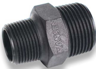
Reducing Hex Nipple BSPT x BSPT

Used as a reducing join, to join two Female Threads.