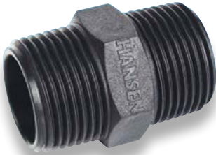
Hex Nipple BSPT x BSPT